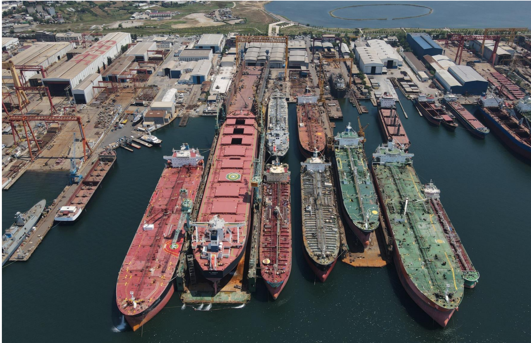
KUZEY STAR | TURKEY