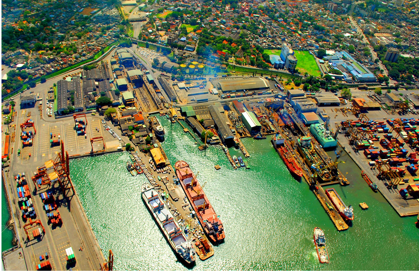
COLOMBO DOCKYARD | SRI LANKA