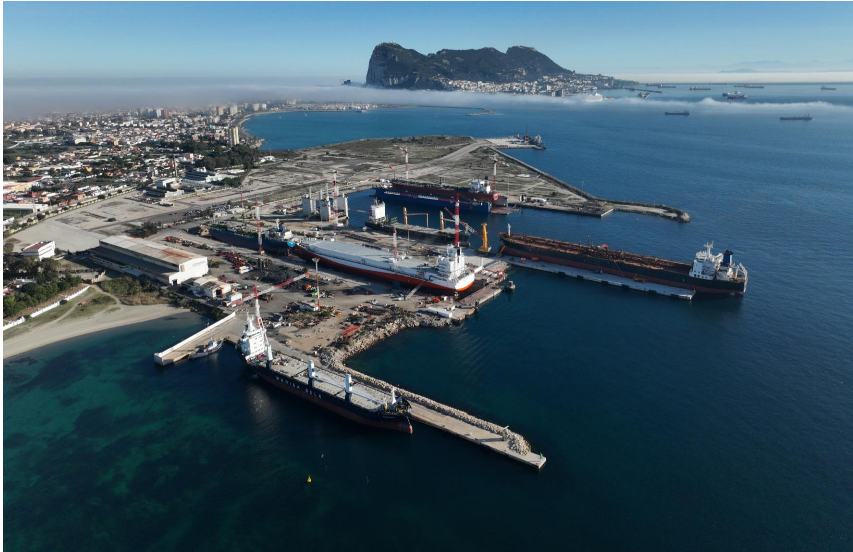
CERNAVAL SHIPYARD | SPAIN