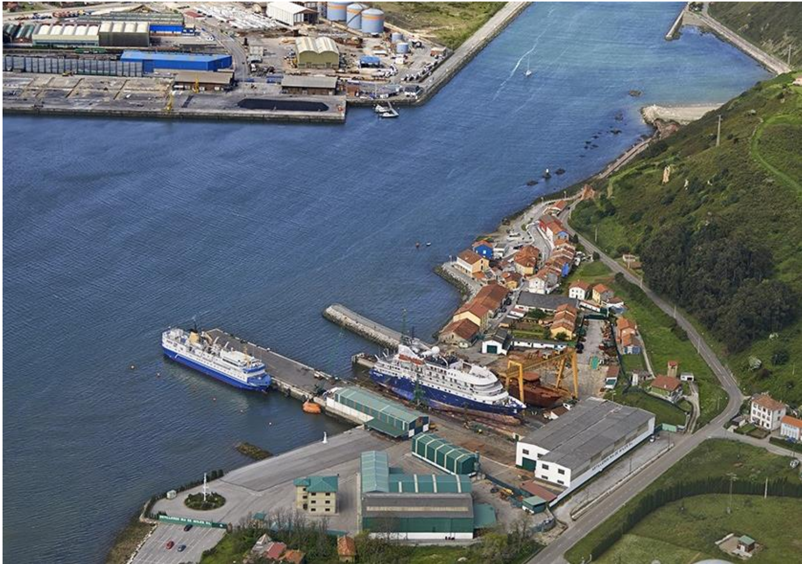
ASTILLEROS RIA DE AVILES | SPAIN