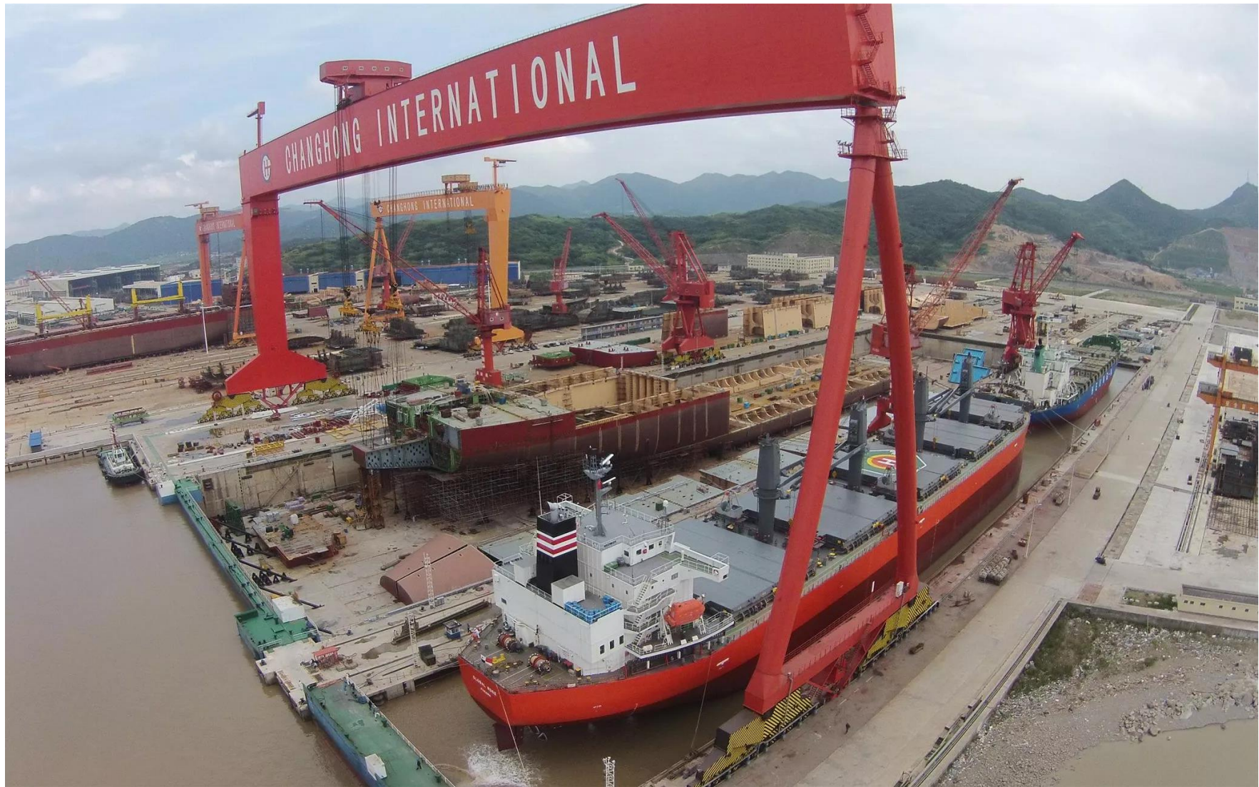
ZHOUSAN CHANGHONG | CHINA