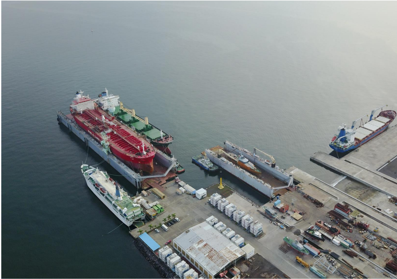
ASABA | EQUATORIAL GUINEA